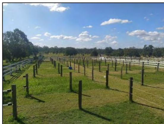
The Bienvenido horse yards