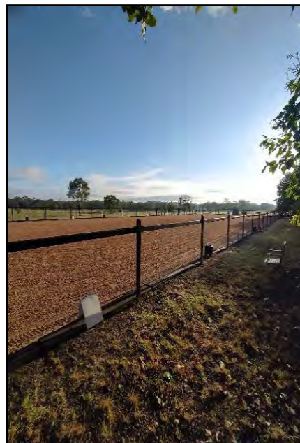
The Bienvenido 60 x 20m arena (This a great arena to walk in, not deep sand and we keep it well watered, so no dust)