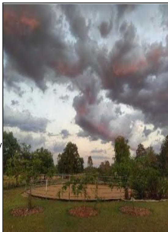
The Bienvenido Round yard (Well-watered for your comfort)

Please note you will be responsible for your horses care during your stay.